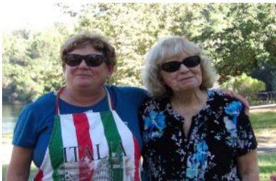
Out Chair Ladies