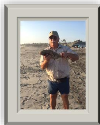
And the winner, so far.....