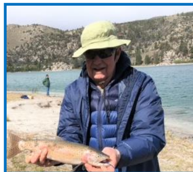
Ron 's Wild Cutthroat