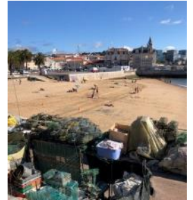
Lobster Traps in Spain

Lobster season opens Saturday, October 2 to March 16, 2022. There is a limit of seven per angler, spiny lobster report card required ($10.54) and fishing license. If you have never tried to catch lobsters it’s a fun experience.