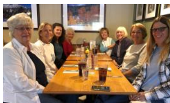
Lunch at Mammoth