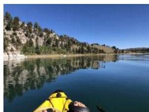
View from Linda's Kayak

There were less fish caught this year, due to lack of stocking. That's our story and we're sticking to it.