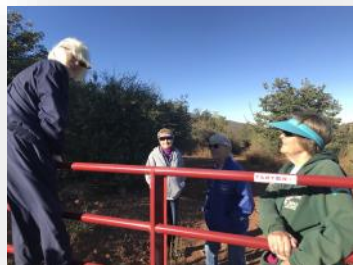
You can't stop Lady Anglers with a fence.