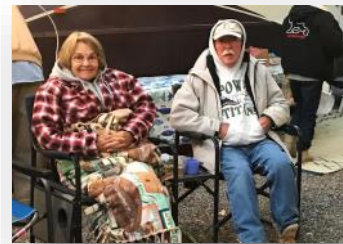
Our Wagon Masters