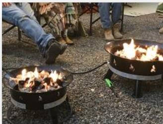
Yay! Smokeless Campfires