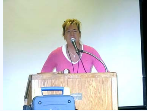
Joslyn Senior Center Director thanking our club for the gift of a new refrigerator.