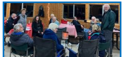
Evening in the Pavilion