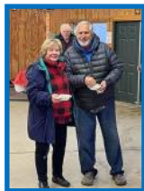
Our great Assistant Wagen Masters,