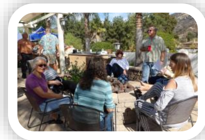
Enjoying the beautiful day.