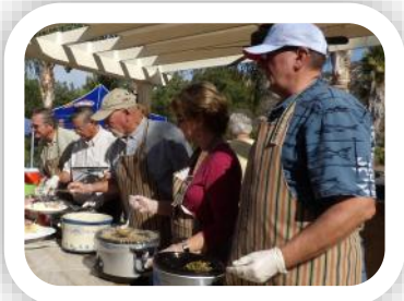
The Board of directors served the food.